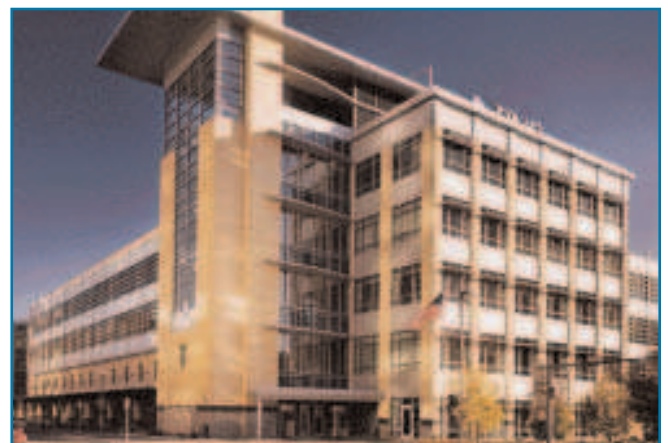
PNC Firstside Center Location: Pittsburgh, PA Products: Sungate® 500 Glass Architect: L.D. Astorino Companies Glazing Contractor: Ajay Glass & Mirror Co., Inc. Glass Fabricator: Pdc Glass and Metal Services, Inc.