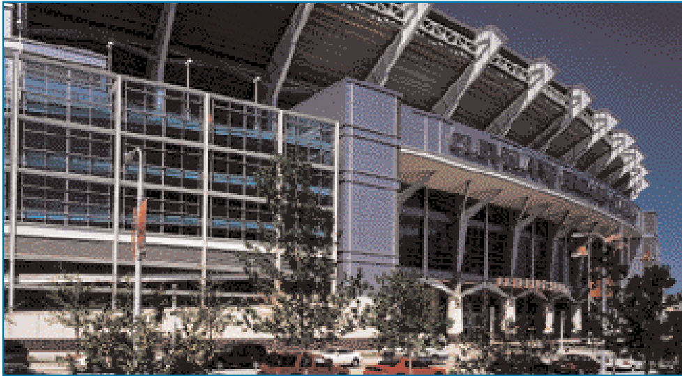
Cleveland Browns Stadium Location: Cleveland, OH Products: Azuria™/Sungate® 500 Glass Architect: Hellmuth, Obata & Kassabaum Glazing Contractor: R.E. Krug Corp. Glass Fabricator: Pdc Glass and Metal Services, Inc.